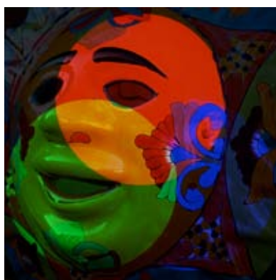
Figure 4. "Three colors (sometimes called primaries) can be mixed together to make other colors. This picture shows a colorful sun mask from New Mexico (yellow with other bright colors painted on it) with overlapping circles of red, green, and blue light falling on it. Can you figure out where the different colors of light are falling and why different parts of the mask look the way they do?"