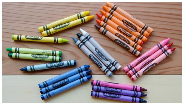
Figure 3. "If we try to sort colors, like these crayons, in a meaningful way, we need three types of descriptions. The first is whether they are colorful (those on the outside) or not (the white, black and gray in the middle), the second is by hue, or color name, such as red, orange, yellow, green, blue, and purple around the circle. And the third is by how light or dark the colors are. With those three types of describing words, we can accurately describe any colored object we can see."

As mentioned previously, approximately 200 student-submitted questions and short answers are included on a separate, but linked from each module, page called Short Answers . The final topic, Explorations , consists of a large number of books and website links for further research and learning at each level. This page is also linked through each of the modules along with the ever-present link to the feedback page.